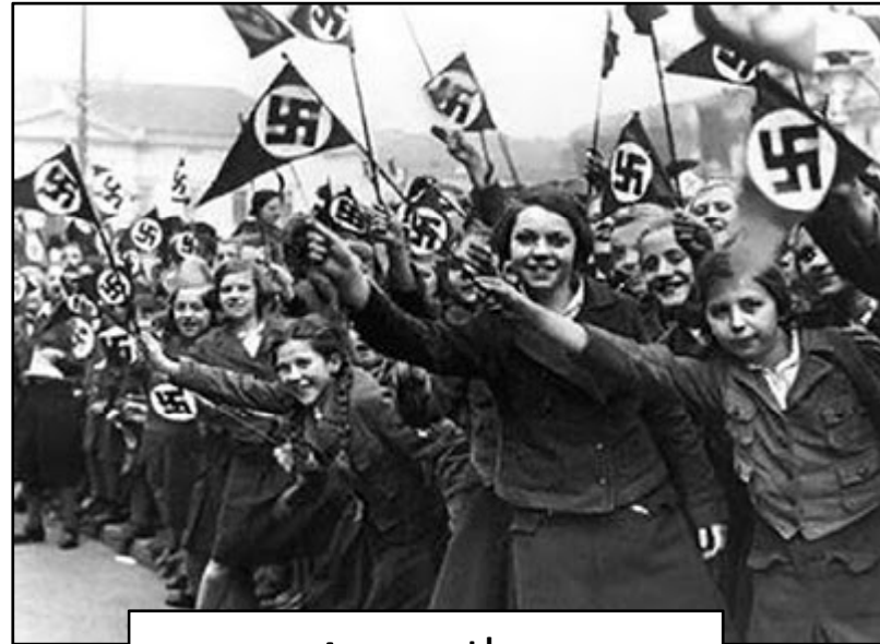
March 12 th 1938

Manchurian Crisis: Japanese troops cheering a victory